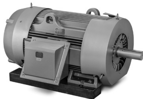
Conversion base kit CB5744T with ECR93504TR-4

Applications: Designed to meet the needs of the Aggregate & Mining Industry where the installed base of motors includes similar rating in both 449T and 586/587 frames. This conversion base kit will allow a customer to mount any Baldor-Reliance NEMA 449T frame into an existing NEMA 586/587 application.