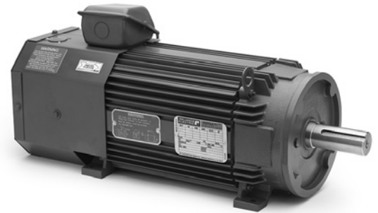
RPM XE, Power Dense